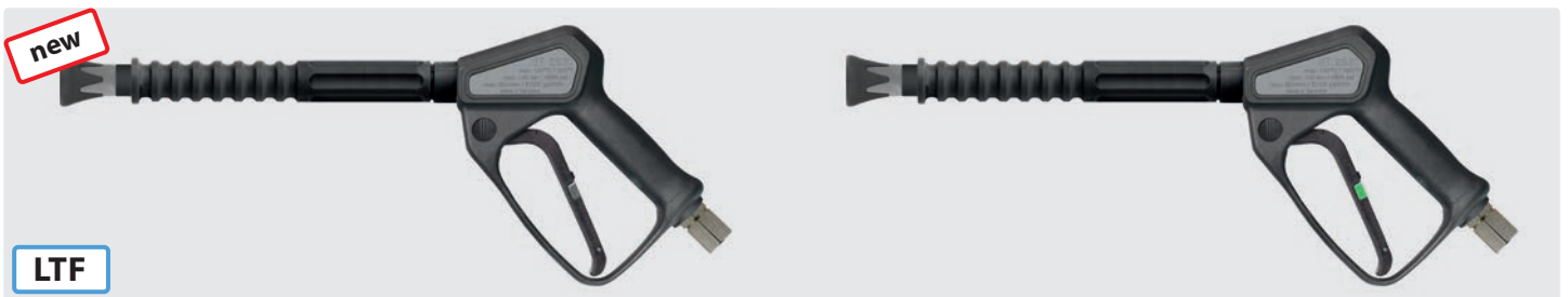
Professional low pressure foam lance with patented LTF technology. Gun ST-2620 with 300 mm insulated lance and nozzle protection ST-10 with low-pressure nozzle 9040. Max. 125 bar / 80 l / min / 150 °C