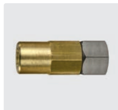
1/4" F : 3/8" F. ST-2300