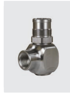
☑ M28 M. DN 12. Max. 300 bar / 90 °C