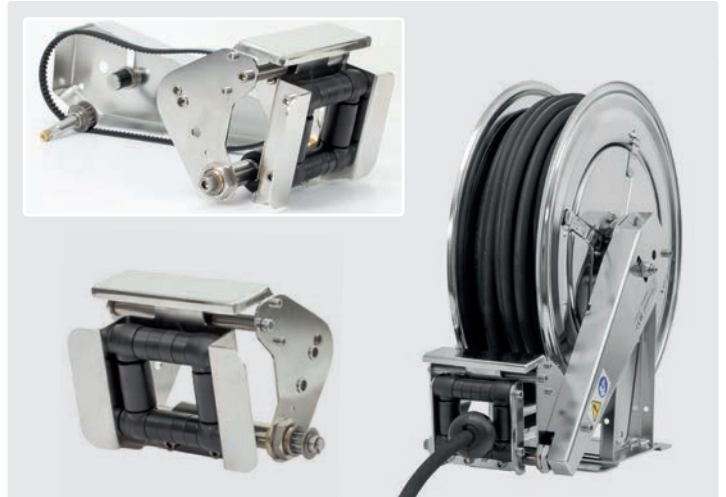
For Model R+M 434, R+M 532, R+M 534, R+M 544 and R+M 564