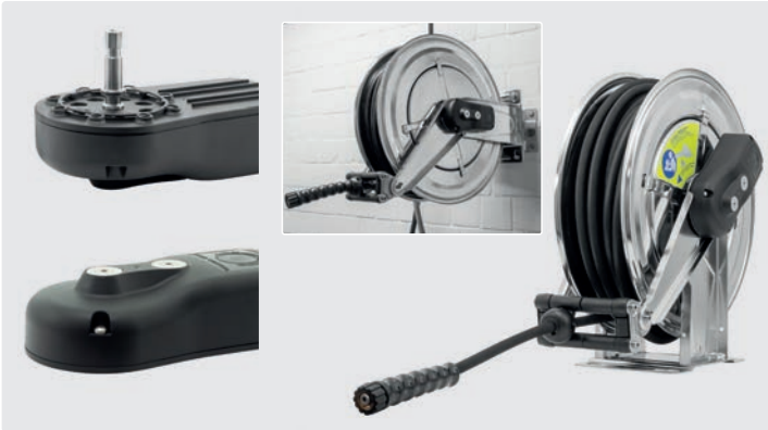
For Model R+M 434, R+M 532, R+M 534, R+M 544 and R+M 564