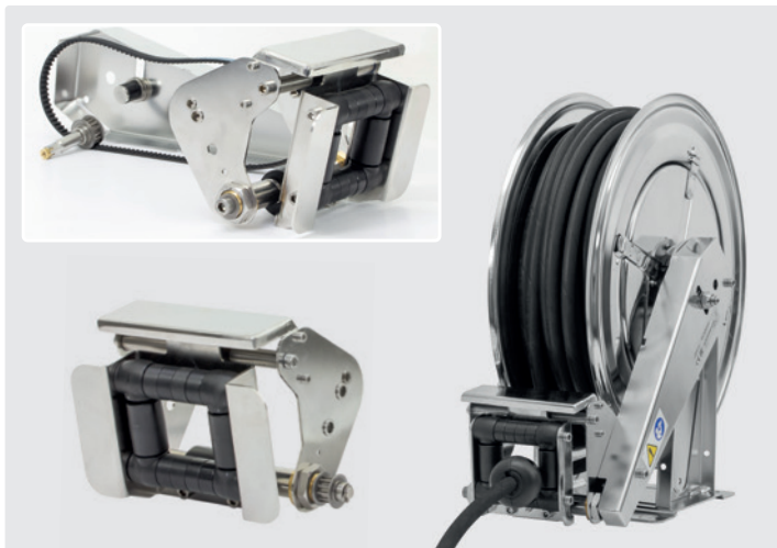
For Model R+M 434, R+M 532, R+M 534, R+M 544 (1/2" / 1") and R+M 564