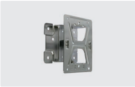
Stainless steel V2A / AISI 304. 80° swivel