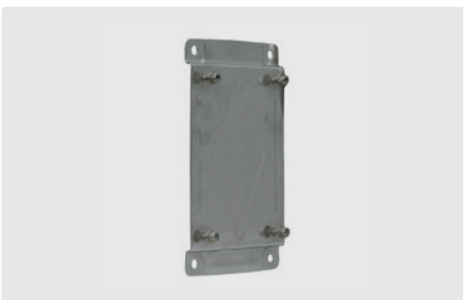
Stainless steel. Optionally as fit-up aid