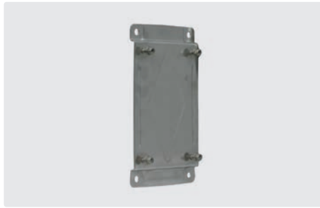
Stainless steel. Optionally as fit-up aid