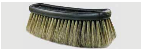
Brush. A= 260. B= 230 x 80 mm. Hog hair