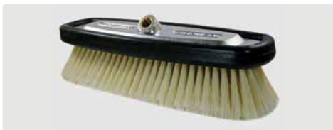
A= 300. B= 300 x 100 mm. Nylon