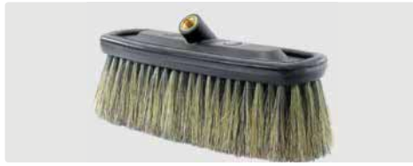
A= 260. B= 230 x 80 mm. Hog hair. Max. 50 °C