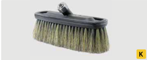
A= 260. B= 230 x 80 mm. Hog hair. Max. 50 °C