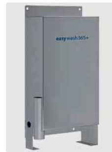
Container with over-flow and lateral drain for cleaning. For wall and floor mounting. H x W x D = 670 x 340 x 143 mm