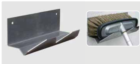
Suitable for all brushes. Hole spacing 202 mm. H x W x D = 90 x 250 x 100 mm