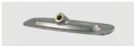
Frame. 260 mm. Aluminium