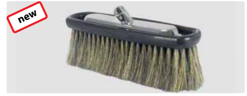
A= 260. B= 230 x 80 mm. Hog hair. With stainless steel frame. Max. 50 °C