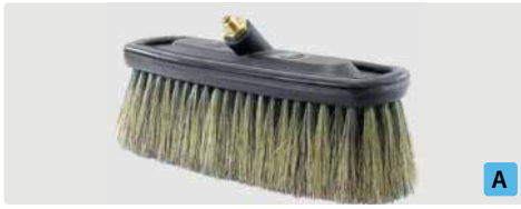
A= 260. B= 230 x 80 mm. Hog hair. Max. 50 °C