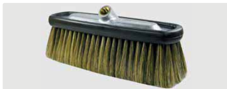
A= 240. B= 230 x 80 mm. Hog hair