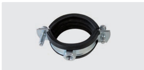
Stainless steel V2A. 1.4301 / AISI 304