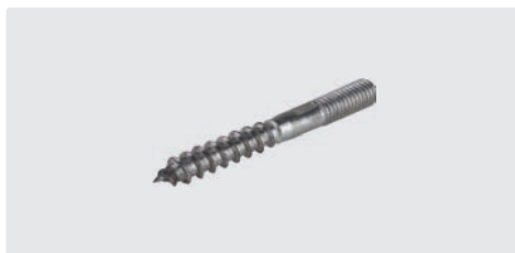
Hanger bolt. Stainless steel. M8 x 80