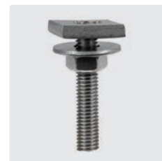
M8 x 30. Stainless steel.