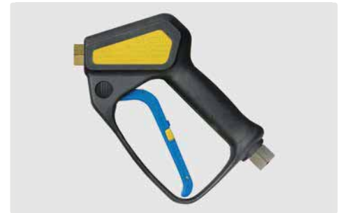
Professional gun. Weep version. Max. 310 bar / 45 l/min / 150 °C