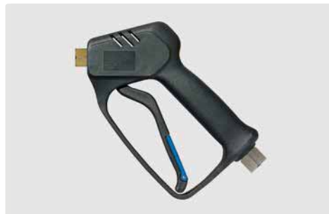
Professional gun. Weep version. Max. 210 bar / 25 l/min / 150 °C