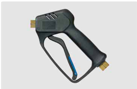
Professional gun. Weep version. Max. 210 bar / 25 l/min / 150 °C