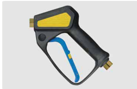
Professional gun. Weep version. Max. 310 bar / 45 l/min / 150 °C