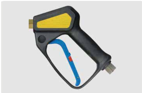
Professional gun. Freeze stop version. Max. 310 bar / 45 l/min / 150 °C