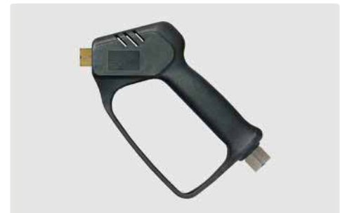
Professional gun without valve. Max. 210 bar / 25 l/min / 150 °C