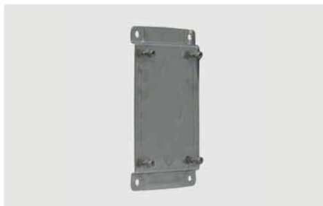
Stainless steel. Optionally as fit-up aid