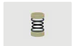
Repair kit swivel ST-322