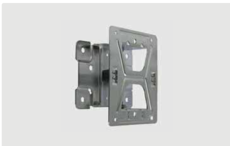
Stainless steel V2A / AISI 304. 80° swivel