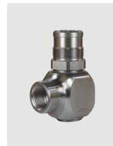
⊖ M28 M. DN 12. Max. 300 bar / 90 °C