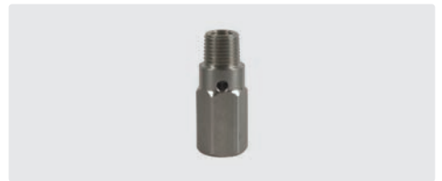
1/4" M : 1/4" F. Flow at 100 bar