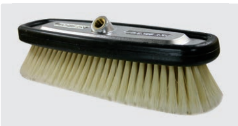
A= 300. B= 300 x 100 mm. Nylon