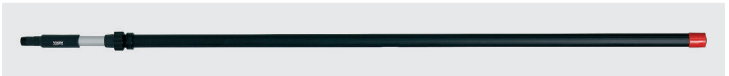
Aluminium handle. Telescopic handle with insulated grip