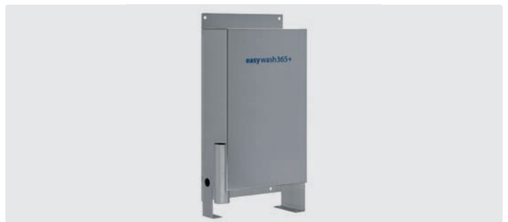
Container with overflow and lateral drain for cleaning. For wall and floor mounting. H x W x D = 670 x 340 x 143 mm