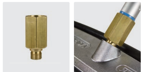
Adaptor for lances with coarse thread. Coarse thread : 1/4" M