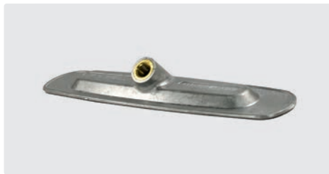
Frame. 260 mm. Aluminium