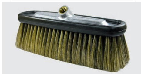
A= 240. B= 230 x 80 mm. Hog hair