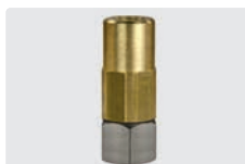
1/4" F : 3/8" F. easywash365+ guns