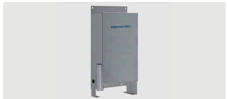
Container with overflow and lateral drain for cleaning. For wall and floor mounting. H x W x D = 670 x 340 x 143 mm