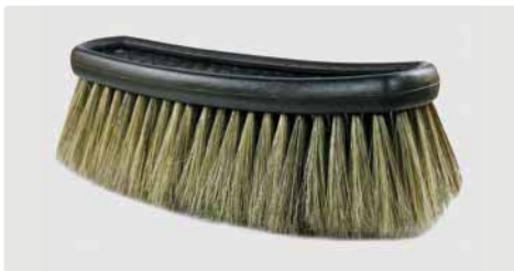
Brush. A= 260. B= 230 x 80 mm. Hog hair