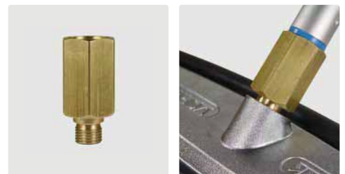
Adaptor for lances with coarse thread. Coarse thread : 1/4" M