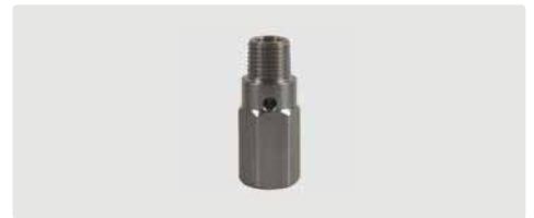
1/4" M : 1/4" F. Flow at 100 bar