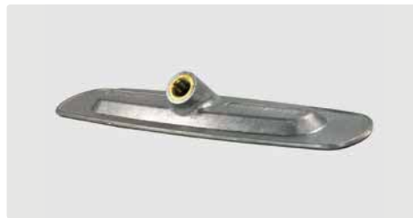
Frame. 260 mm. Aluminium