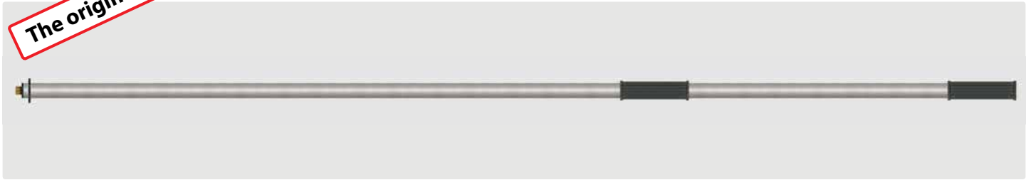
Extension pipe with water flow