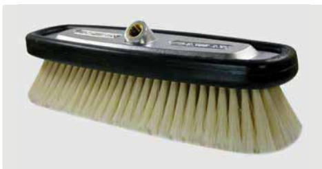
A= 300. B= 300 x 100 mm. Nylon