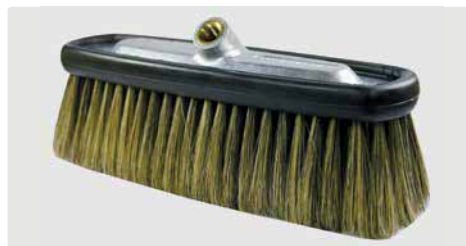
A= 240. B= 230 x 80 mm. Hog hair