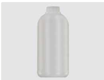
Bottle 1 liter