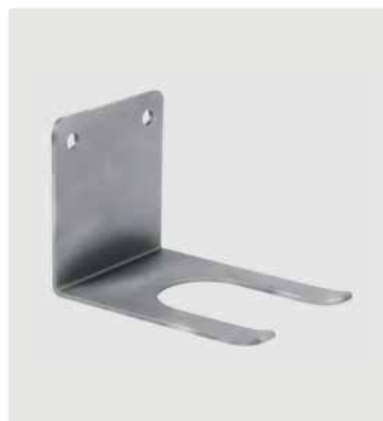
Wall bracket. Stainless steel. 68 mm x 95 mm. Incl. mounting parts