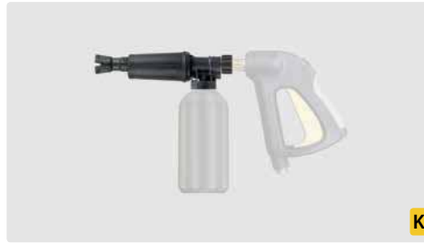
M22 F. Foam injector lance with regulator and bottle. Max. 300 bar / 80 °C