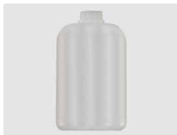
Bottle 2 liter