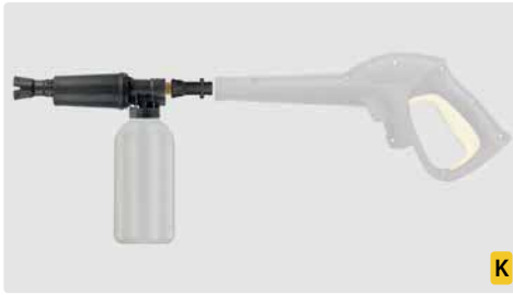
Bayonet K. Plastic. Foam injector lance with regulator and bottle. Max. 180 bar / 80 °C