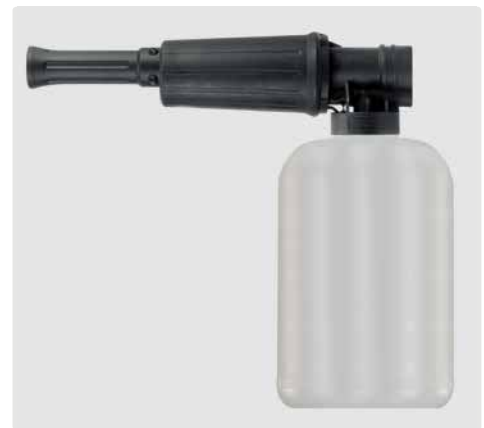
1/4" F. Foam injector lance with regulator and bottle. Without foam pad. Max. 300 bar / 80 °C

Don't lose any more time and feel invited to test it now!