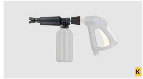
M22 F swivel. Foam injector lance with regulator and bottle. Max. 300 bar / 80 °C