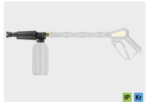
M22 M. Foam injector lance with regulator and bottle. Max. 300 bar / 80 °C