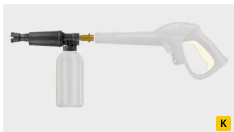
Bayonet K. Brass. Foam injector lance with regulator and bottle. Max. 300 bar / 80 °C