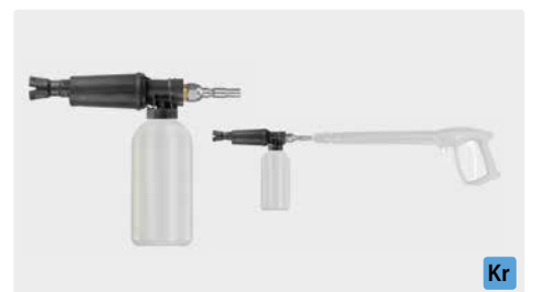
Plug KR. Foam injector lance with regulator and bottle. Max. 300 bar / 80 °C