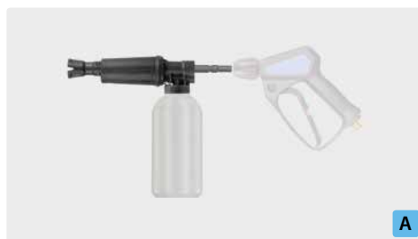
Plug KW. Foam injector lance with regulator and bottle. Max. 300 bar / 80 °C