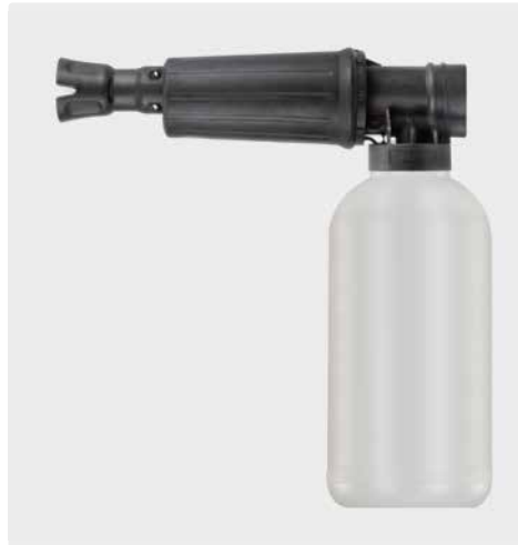
1/4" F. Foam injector lance with regulator and bottle. Max. 300 bar / 80 °C