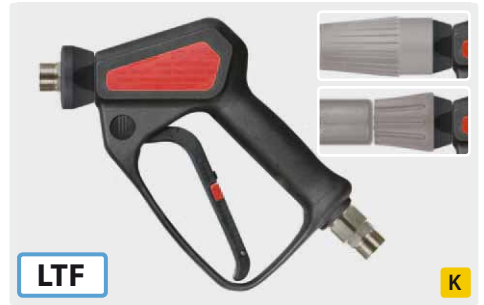
Professional ultra high pressure gun with patented LTF. Gun with insulated outlet suitable for lances with swivel screw coupling. Max. 500 bar / 30 l/min / 150 °C