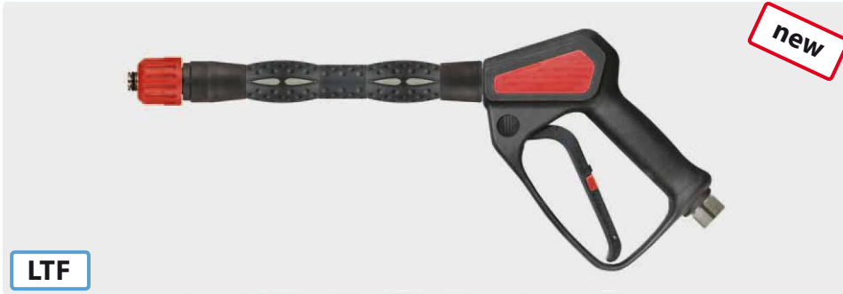
Professional ultra high pressure gun with extension ST-9.1 210 mm and quick screw coupling ST-740. Max. 500 bar / 30 l/min / 150 °C