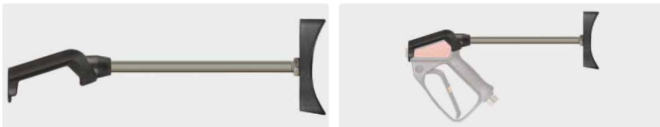
New European Union guidelines imperatively prescribe the use of shoulder supports for cleaning applications exceeding an operating reaction force of 150 N.