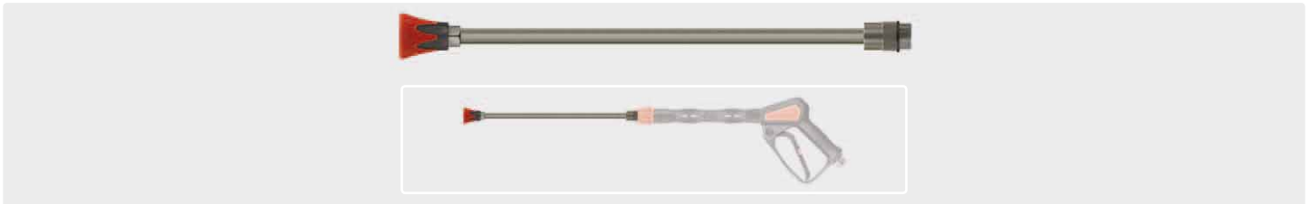
M24 M. Lance 400 mm with nozzle protector ST-10 without nozzle. Lance for ultra high pressure guns with extension ST-9.1. Max. 600 bar / 150 °C