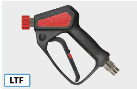
Professional ultra high pressure gun with patented LTF. Max. 500 bar / 30 l/min / 150 °C