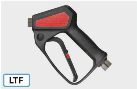
Professional ultra high pressure gun with patented LTF. Max. 500 bar / 30 l/min / 150 °C