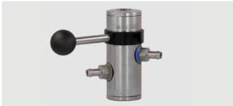
Bypass injector ST-168 with hose tail 9 mm and compressed air module (hose tail 9 mm).