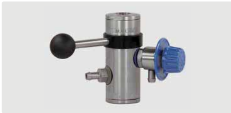
Bypass injector ST-168 with metering valve ST-161 & compressed air module (hose tail 9 mm).