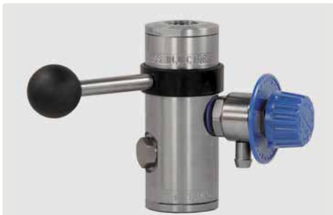
easyfoam365+ bypass injector ST-167 with metering valve ST-161 and hose tail 9 mm