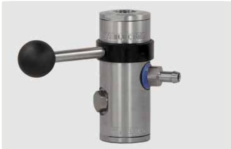
easyfoam365+ bypass injector ST-167 with hose tail 9 mm