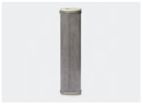
Stainless steel. Max. 120 °C