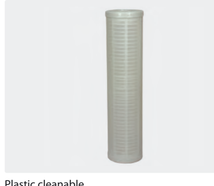
Plastic cleanable. Max. 40 °C