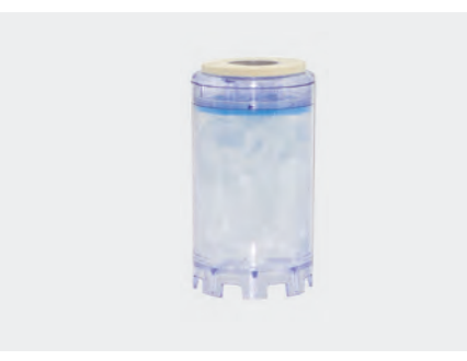
Water softener. Polyphosphate