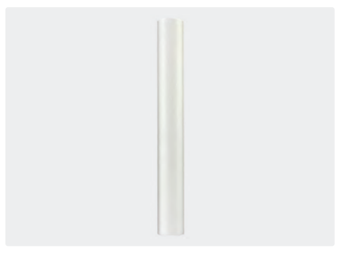
Polypropylene. Max. 40 °C