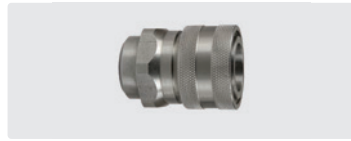
Coupling : F. Stainless steel. Max. 250 bar / 150 °C