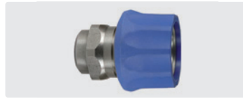
Coupling : F. Stainless steel. Max. 250 bar / 150 °C