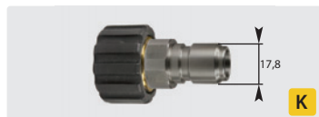
Plug : F. Stainless steel + brass. Max. 250 bar / 150 °C