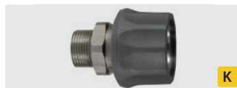
Coupling : M. Stainless steel. Max. 250 bar / 150 °C