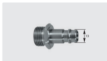
Plug : M. Stainless steel. Max. 150 bar / 90 °C