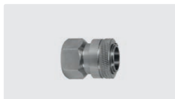
Coupling : F. Stainless steel. Max. 150 bar / 90 °C