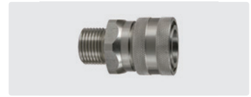
Coupling : M. Stainless steel. 60° cone. Max. 250 bar / 150 °C