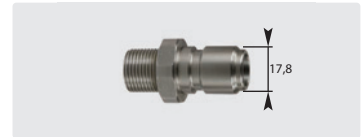
Plug : M. Stainless steel. 60° cone. Max. 250 bar / 150 °C