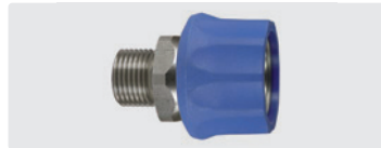
Coupling : M. Stainless steel. 60° cone. Max. 250 bar / 150 °C