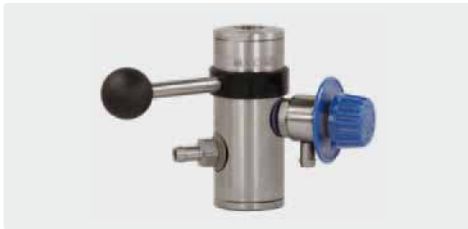
Bypass injector ST-168 with metering valve ST-161 & compressed air module (hose tail 9 mm).