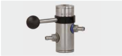
Bypass injector ST-168 with hose tail 9 mm and compressed air module (hose tail 9 mm).