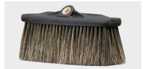
A= 270. B= 260 x 80 mm. Hog hair / synthetic. Max. 40 l/min / 60 °C