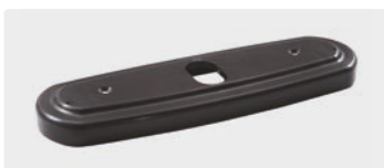
Cover suitable as theft protection for wash brushes. Plastic. Max. 50 °C