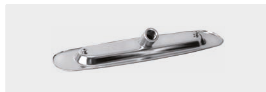
Frame with fixing bolts. Stainless steel. Max. 60 °C