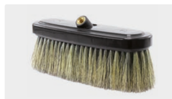
A= 260. B= 230 x 80 mm. Hog hair. Max. 50 °C