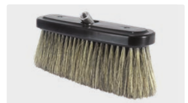
A= 260. B= 230 x 80 mm. Hog hair. With stainless steel frame. Max. 50 °C