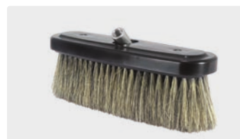
A= 260. B= 230 x 80 mm. Hog hair. With stainless steel frame. Max. 50 °C