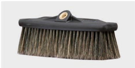
A= 270. B= 260 x 80 mm. Hog hair. Max. 40 l/min / 60 °C