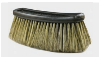
A= 260. B= 230 x 80 mm. Hog hair. Max. 50 °C