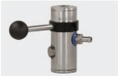
easyfoam365+ bypass injector ST-167 with hose tail 9 mm