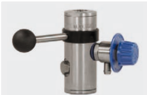
easyfoam365+ bypass injector ST-167 with metering valve ST-161 and hose tail 9 mm