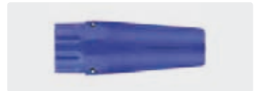
M18 F. Brass. ST-75 with nozzle. Max. 350 bar / 100 °C