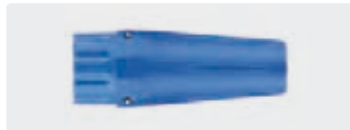
M18 F. Brass. ST-75 with nozzle. Max. 350 bar / 100 °C