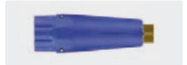
1/4" F. Brass. ST-75 with nozzle. Max. 350 bar / 100 °C