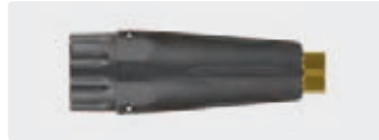
1/4" F. Brass. ST-75 with nozzle. Max. 350 bar / 100 °C