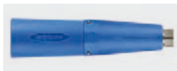
1/4" F. Stainless steel. ST-75 with nozzle and without foam pad. Max. 350 bar / 100 °C