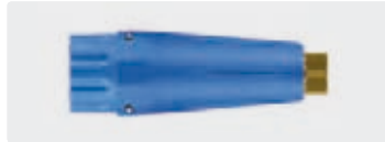
1/4" F. Brass. ST-75 with nozzle. Max. 350 bar / 100 °C