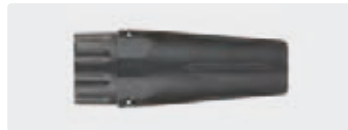
M18 F. Brass. ST-75 with nozzle. Max. 350 bar / 100 °C