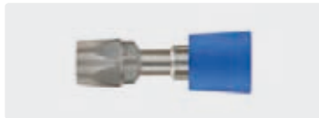
M18 F. Stainless steel. ST-75 with nozzle. Max. 350 bar / 100 °C