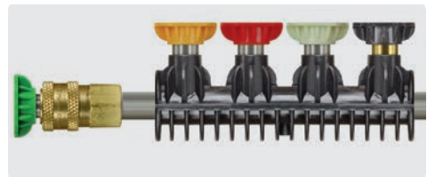
Coupling 1/4" F NPT