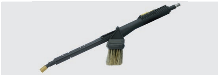
Self-service lances with brush longitudinal. Brush with nozzle protector for nozzle 1/8" M. Without high pressure nozzle