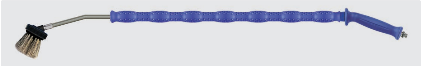
Lance with moulded handle Cool & Compact, easywash365+ handle, air injector and wash brush (bristles 60 mm). Max. 50 °C