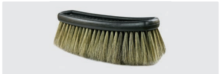
Original Vorwerk. Brush hog hair. A= 260. B= 230 x 80 mm.