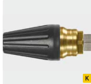
M18 F. Spray angle 20°. 200 - 400 bar. Max. 100 °C