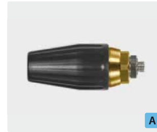
1/8" M. Spray angle 20°. 100 - 250 bar. Max. 100 °C