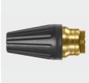
1/4" F. Spray angle 20°. 200 - 400 bar. Max. 100 °C