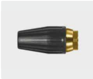
1/4" F. Spray angle 20°. 100 - 250 bar. Max. 100 °C