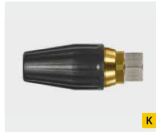
M18 F. Spray angle 20°. 100 - 250 bar. Max. 100 °C