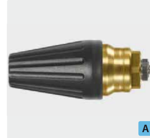
1/8" M. Spray angle 20°. 200 - 400 bar. Max. 100 °C