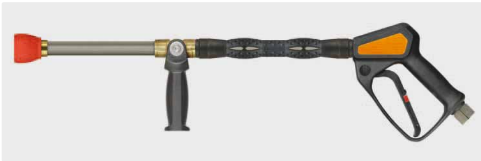
1/2" F. Longcast lance 500 mm with vented handle ST-9.1 260 mm, gun ST-2320, grip aside and nozzle protector made out of plastic without nozzle. Max. 150 bar / 80 l/min