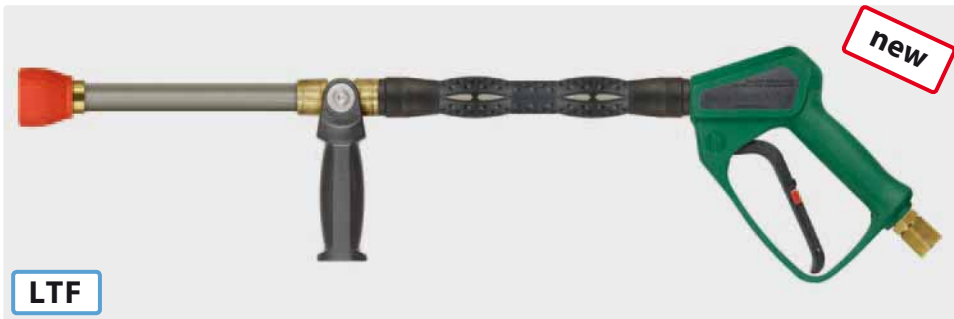
1/2" F. Longcast lance 500 mm with vented handle ST-9.1 260 mm, gun easyfarm365+ , grip aside and nozzle protector made out of plastic without nozzle. Max. 180 bar / 60 l/min