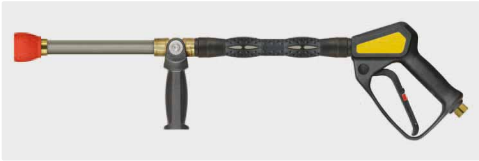
3/8" F. Longcast lance 500 mm with vented handle ST-9.1 260 mm, gun ST-2300, grip aside and nozzle protector made out of plastic without nozzle. Max. 180 bar / 45 l/min