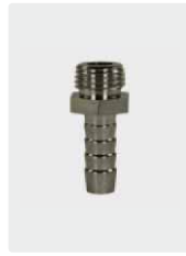
Stainless steel. Max. 150 °C