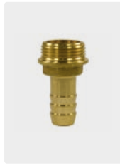
Brass. Max. 150 °C