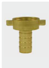
Brass. Max. 150 °C