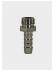
Stainless steel. Max. 150 °C