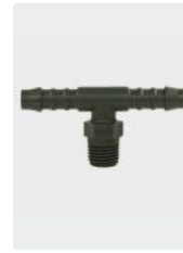
Plastic. Max. 60 °C