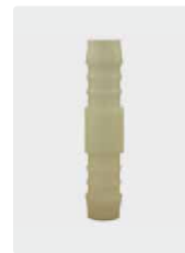
Plastic. Max. 60 °C