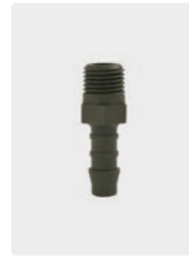
Plastic. Max. 60 °C