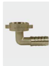
Brass. Max. 150 °C