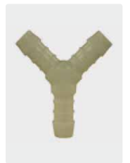
Plastic. Max. 60 °C