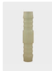
Plastic. Max. 60 °C