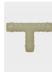
Plastic. Max. 60 °C