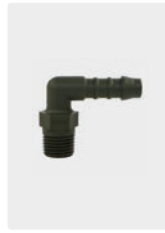
Plastic. Max. 60 °C