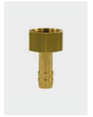
Brass. Max. 150 °C