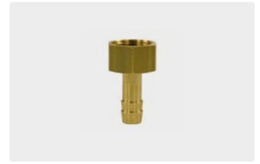
Brass. Max. 150 °C