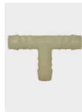
Plastic. Max. 60 °C