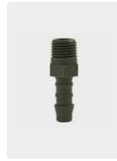
Plastic. Max. 60 °C