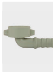
Plastic. Max. 60 °C