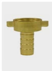
Brass. Max. 150 °C