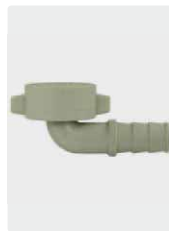
Plastic. Max. 60 °C