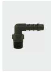
Plastic. Max. 60 °C