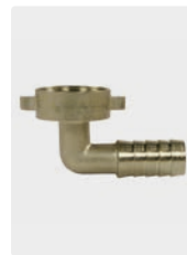
Brass. Max. 150 °C