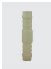
Kunststoff. Max. 60 °C