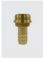
Messing. Max. 150 °C