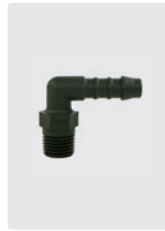
Kunststoff. Max. 60 °C