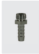
Edelstahl. Max. 150 °C