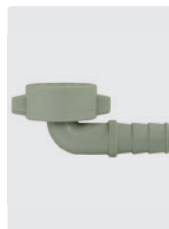
Kunststoff. Max. 60 °C