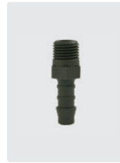
Kunststoff. Max. 60 °C