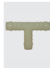
Kunststoff. Max. 60 °C