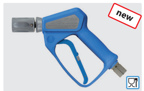
ST-2320 with adjustable nozzle ST-51.1

Professional gun with adjustable nozzle ST-51.1. Application, e.g. in foam and rinsing applications in the food industry. Stainless steel/brass. Valve piston made of stainless steel. PEEK seat. EPDM seal. Max. 150 bar / 80 l/min. / 150 °C