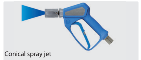
Conical spray jet