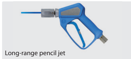
Long-range pencil jet