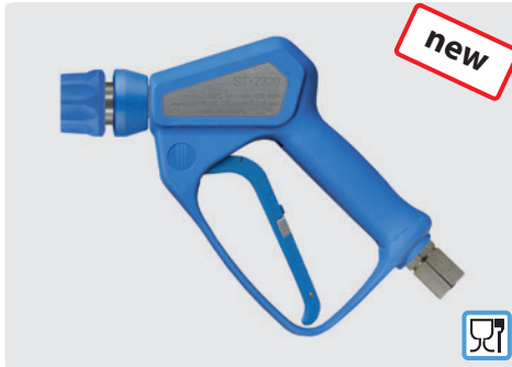
ST-2320 with coupling ST-3100

Professional gun with coupling ST-3100. Application, e.g. in foam and rinsing applications in the food industry. Stainless steel/brass. Valve piston made of stainless steel. PEEK seat. EPDM seal. Max. 150 bar / 80 l/min. / 150 °C