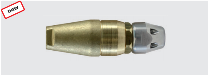
ST-357.1. Max. 250 bar / 100 °C

enough cutting force to blast through roots and scale. It is also ideal for cutting up and shredding tissue and fat deposits