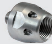
Hardened stainless steel. 6 M5 threads for nozzle inserts (see table below)