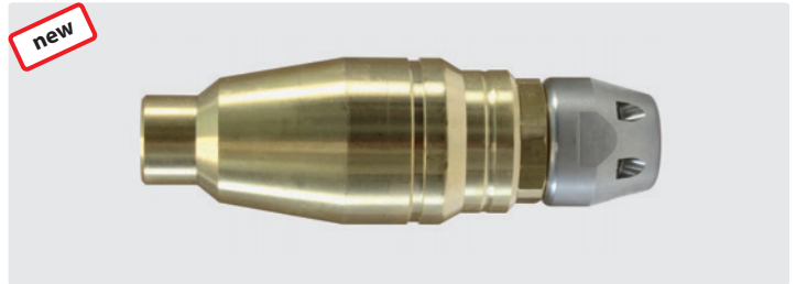
ST-458.1. Max. 400 bar / 100 °C