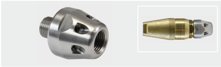
For ST-357/ST-456 rotating nozzles. Hardened stainless steel. Max. 350 bar. ⌀ 1/4" M and 6 M5 threads for nozzle inserts (see table below).

enough cutting force to blast through roots and scale. It is also ideal for cutting up and shredding tissue and fat deposits