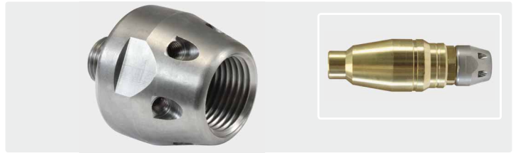
For ST-458/ST-559 rotating nozzles. Hardened stainless steel. Max. 500 bar. ⌀ 1/4" M and 6 M5 threads for nozzle inserts (see table below).