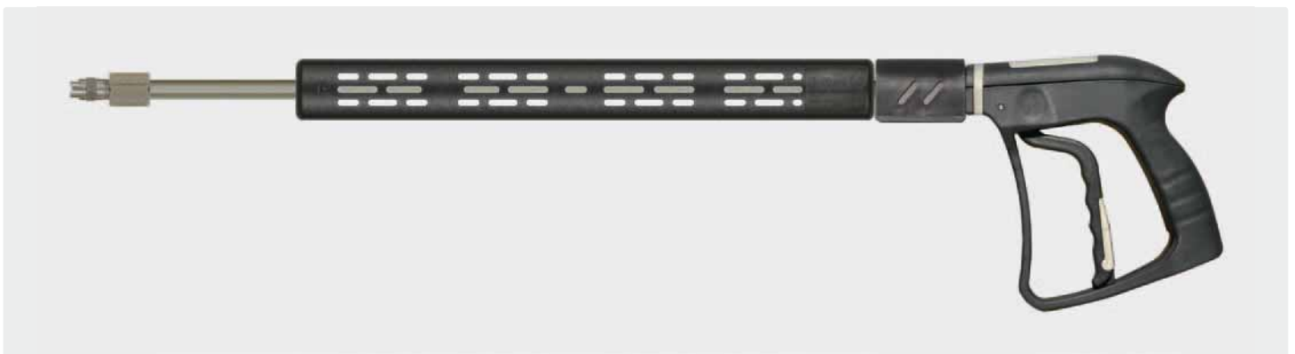
Professional steam gun ST-4000 with lance 500 mm stainless steel with vented handle ST-9 380 mm and steam low pressure nozzle made out of stainless steel. Max. 20 bar / 200 °C