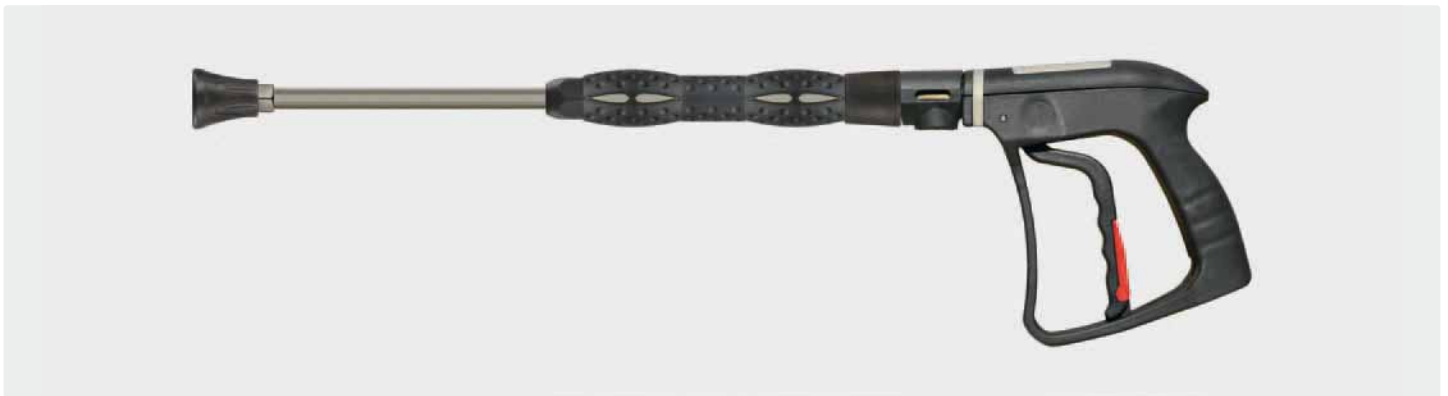
Professional steam gun ST-860D with lance 400 mm stainless steel, vented handle ST-9.1 220 mm and nozzle protector ST-12 without nozzle. Max. 20 bar / 200 °C