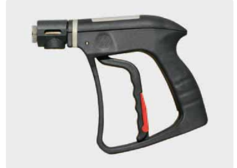
Professional steam gun ST-860D. Brass. Max. 20 bar / 200 °C