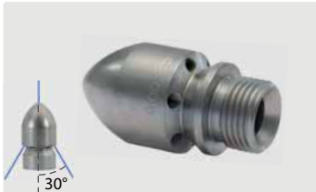
1/2" M. MR cone. Outside \varnothing 30 mm. 6 rear jets, with front jet