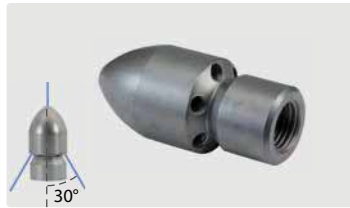
1/4" F. Outside \varnothing 25 mm. 6 rear jets, with front jet