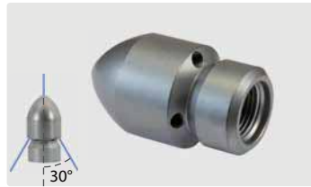
3/8" F. Outside \varnothing 30 mm. 4 rear jets, with front jet