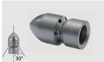
1/2" F. Outside \varnothing 30 mm. 6 rear jets, with front jet