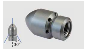
3/8" F. Outside \varnothing 30 mm. 6 rear jets, with front jet