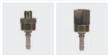
1/4" M. Stainless steel. Single ball bearing. Max. 275 bar / 120 °C 1/4" F. Stainless steel. Single ball bearing. Max. 275 bar / 120 °C