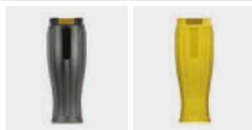
QSC. M22. Crimp nipple zinc-plated steel QSC. M22. Swivel. Crimp nipple stainless steel