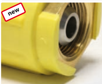
» Hard PVC cover in yellow / black » Brass screw nut » Stainless steel swivel