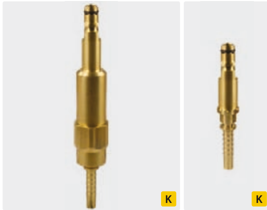
Brass. Swivel Brass