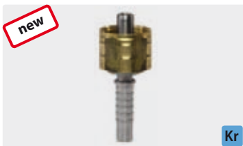
QSC. M22. Screw nut brass. Crimp nipple stainless steel