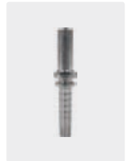
Zinc-plated steel. BEL - BES