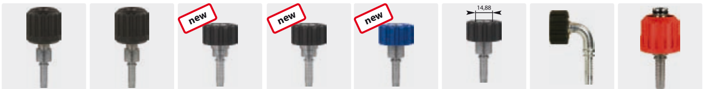
ST-44. Stainless steel. M22 F swivel ST-44. Stainless steel. M21 F swivel M22 F. Zinc-plated steel. Screw nut brass. Type 01 M22 F. Stainless steel. Screw nut stainless steel. Type 02 1/2" F. Zinc-plated steel. Screw nut brass. Type 01 M22 F. Brass. Crimp nipple stainless steel. US-Version 14.88. Type 05 M22 F. 90°. Zinc-plated steel. Type 01 ST-740. M24 x 1.5