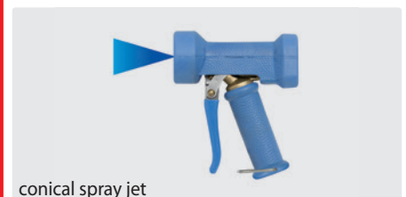
conical spray jet

Further models of the spray guns ST-1200 are available on request.