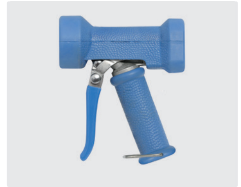
Spray gun with adjustable spray angle. Max. 24 bar / 100 l/min / 50 °C