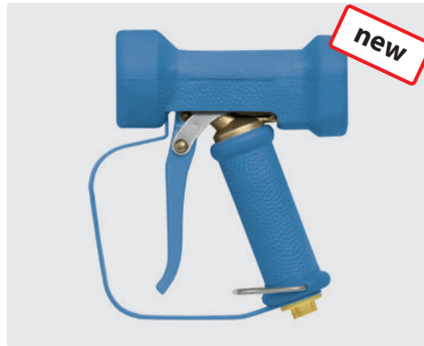
Spray gun with adjustable spray angle. Trigger guard. Max. 24 bar / 100 l/min / 50 °C