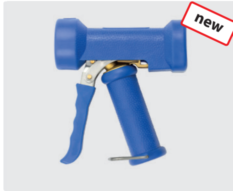
Spray gun with adjustable spray angle. Max. 24 bar / 100 l/min / 50 °C