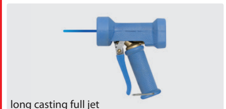
long casting full jet