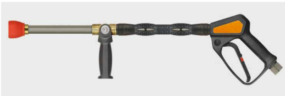
1/2" F. Longcast lance 500 mm with vented handle ST-9.1 260 mm, gun ST-2320, grip aside and nozzle protector made out of plastic without nozzle. Max. 150 bar / 80 l/min