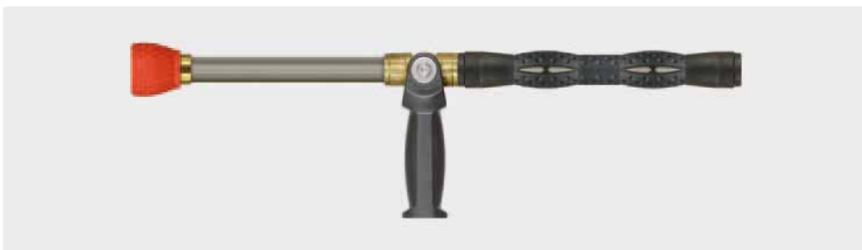
1/4" M. Longcast lance 500 mm with vented handle ST-9.1 260 mm, grip aside and nozzle protector made out of plastic without nozzle. Max. 180 bar / 130 l/min