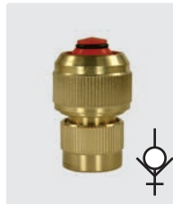
Brass. With tension screw + water stop