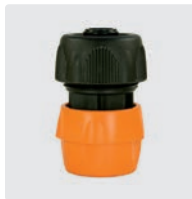
Plastic. With tension screw