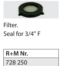
Filter. Seal for 3/4" F