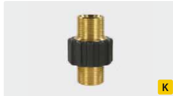
M22 M. Solid version with rubber cover. Max. 400 bar