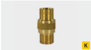
M22 M. Solid version. Brass. Max. 400 bar