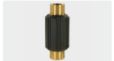
M22 M. Long with moulded handle. Max. 280 bar