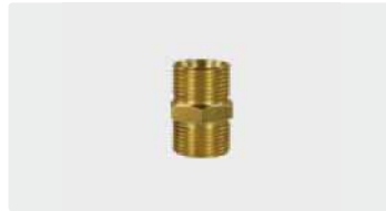
1/2" M. Standard. Brass. Max. 400 bar