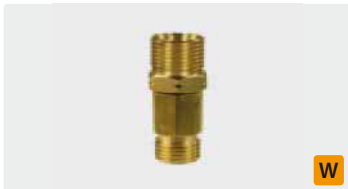
M21 M : M18 M. Brass. Reduction. Max. 400 bar