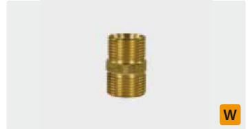
M21 M : M22 M. Brass. Reduction. Max. 400 bar