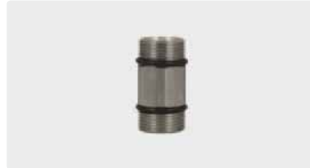
M24 M. Stainless steel. Max. 700 bar