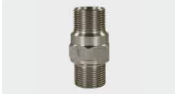
M22 M. Solid version stainless steel. Max. 500 bar