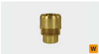
M24 F : M14x1 F. Brass. Max. 400 bar