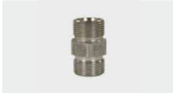
M22 M. DKOS stainless steel. Max. 500 bar