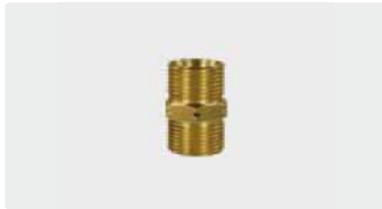
M21 M. Standard. Brass. Max. 400 bar