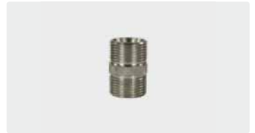
M22 M. Standard. Stainless steel. Max. 400 bar