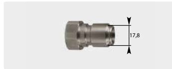
Plug : F. Stainless steel. Max. 250 bar / 150 °C