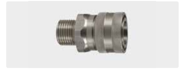
Coupling : M. Stainless steel. 60° cone. Max. 250 bar / 150 °C