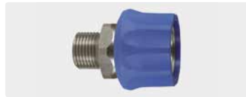
Coupling : M. Stainless steel. 60° cone. Max. 250 bar / 150 °C