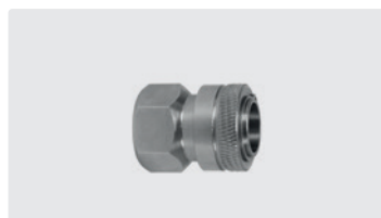
Coupling : F. Stainless steel. Max. 150 bar / 90 °C