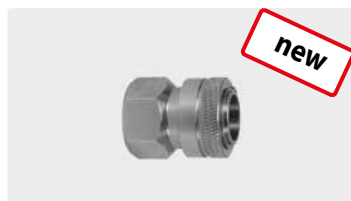
Coupling : F. Stainless steel. Max. 150 bar / 90 °C