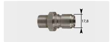
Plug : M. Stainless steel. 60° cone. Max. 250 bar / 150 °C