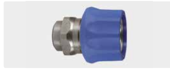
Coupling : F. Stainless steel. Max. 250 bar / 150 °C