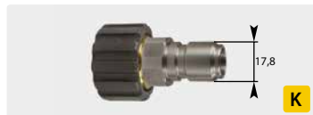
Plug : F. Stainless steel + brass. Max. 250 bar / 150 °C