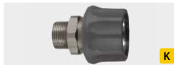
Coupling : M. Stainless steel. Max. 250 bar / 150 °C