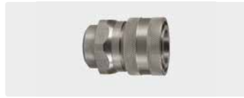
Coupling : F. Stainless steel. Max. 250 bar / 150 °C