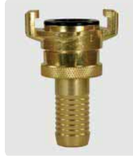
Suction coupling *. Brass