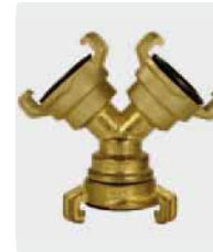
3-way bayonet coupling. Brass