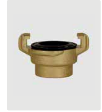
F thread. Flat seal. Brass