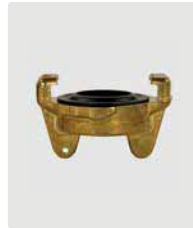
Bayonet blank coupling with gasket. Brass