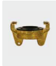
Bayonet blank coupling with gasket. Brass