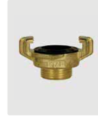
M thread. Brass