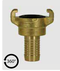
Swivel straight. Brass