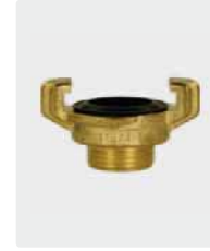
M thread. Brass