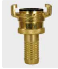
Suction coupling *. Brass