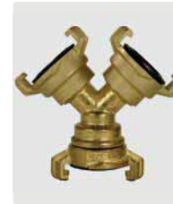
3-way bayonet coupling. Brass