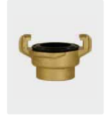
F thread. Flat seal. Brass