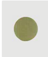
100 meshes/cm². Brass. Strainer insert. \varnothing 33 mm