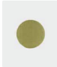
100 meshes/cm². Brass. Strainer insert. ∅ 33 mm