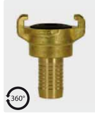
Swivel straight. Brass