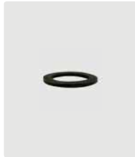
Flat seal. For F thread