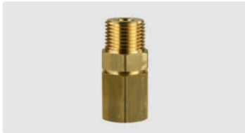
1/2" M : 1/2" F. Brass. Max. 250 bar / 90 °C