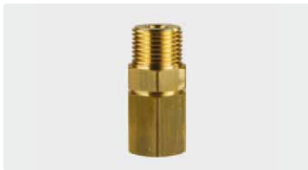
1/2" M : 1/2" F. Brass. Max. 250 bar / 90 °C