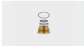
Repair kit swivel ST-351