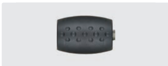
1/4" F : 1/4" M. 350 bar. Stainless