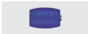
1/4" F : 1/4" M. 350 bar. Stainless. easywash365+ blue