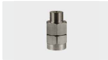
3/8" M : 3/8" F. Stainless steel. Max. 500 bar / 90 °C