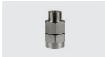
3/8" M : 3/8" F. Stainless steel. Max. 500 bar / 90 °C