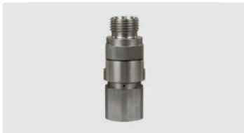
1/2" M : 1/2" F. Max. 600 bar