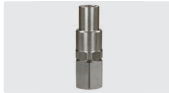
1/4" F : 1/2" F. Stainless steel. Max. 350 bar / 90 °C