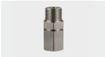
1/2" M : 1/2" F. Stainless steel. Max. 350 bar / 90 °C