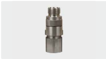
1/2" M : 1/2" F. Max. 600 bar