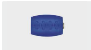
1/4" F : 1/4" M. 350 bar. Stainless