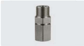
1/2" M : 1/2" F. Stainless steel. Max. 350 bar / 90 °C