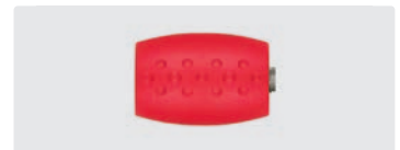
1/4" F : 1/4" M. 350 bar. Stainless