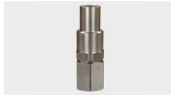
1/4" F : 1/2" F. Stainless steel. Max. 350 bar / 90 °C