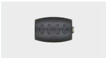
1/4" F : 1/4" M. 350 bar. Stainless