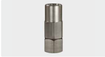
1/4" F : 3/8" F. Stainless steel. Swivel with radial friction bearing. Max. 350 bar / 90 °C