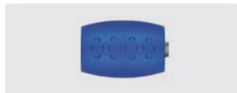
1/4" F : 1/4" M. 350 bar. Stainless. RAL 5005