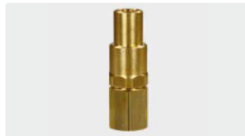
1/4" F : 1/2" F. Brass. Max. 250 bar / 90 °C