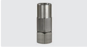
1/4" F : 3/8" F. Stainless steel. Swivel with radial friction bearing. Max. 350 bar / 90 °C