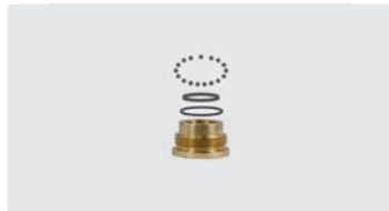
Repair kit swivel ST-351