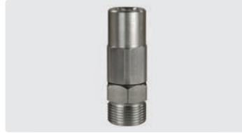
1/4" F : M22 M. Stainless steel. Swivel with radial friction bearing. Max. 350 bar / 90 °C