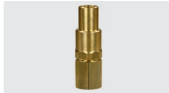
1/4" F : 1/2" F. Brass. Max. 250 bar / 90 °C