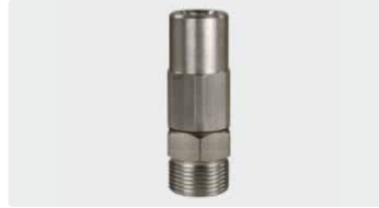
1/4" F : M22 M. Stainless steel. Swivel with radial friction bearing. Max. 350 bar / 90 °C