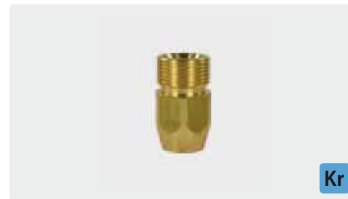
M22 F : F. With hexagon. Max. 400 bar / 150 °C