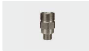
M22 M : 1/4" M. Long. Max. 400 bar / 150 °C