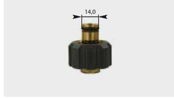
M22 F : F. Max. 400 bar / 150 °C