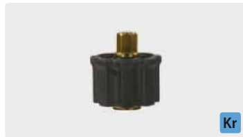
M22 F : F. Max. 400 bar / 150 °C