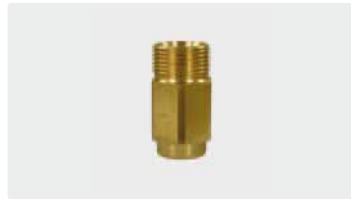
M22 M : F. Long. Max. 400 bar / 150 °C