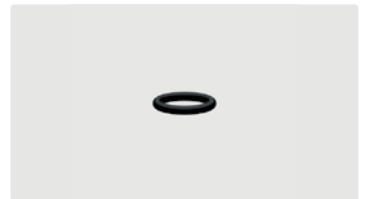
O-ring. Quick screw coupling US. 10.77 x 2.62. NBR 70