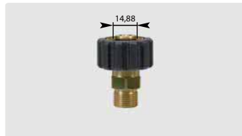
M22 F : F. Max. 400 bar / 150 °C