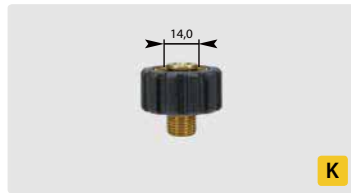
M22 F : M. Max. 400 bar / 150 °C