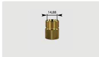
M22 : F. Max. 400 bar / 150 °C