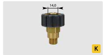
M22 F : M. Max. 400 bar / 150 °C