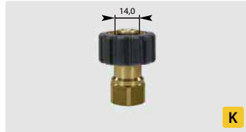
M22 F : F. Max. 400 bar / 150 °C