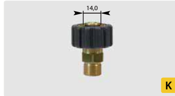
M22 F : M. Max. 400 bar / 150 °C