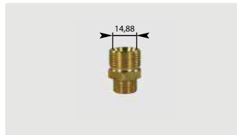
M22 : M. Max. 400 bar / 150 °C