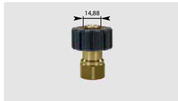
M22 F : F. Max. 400 bar / 150 °C