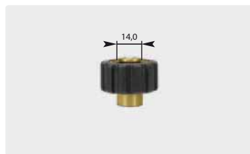
Short M22 : F. Black. Max. 400 bar / 150 °C