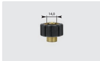
Short M22 : F. Black. Max. 400 bar / 150 °C