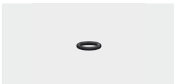
O-ring. 10x2.2. Perbunan