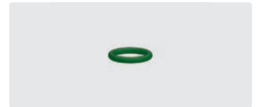
O-ring. 10x2. Viton