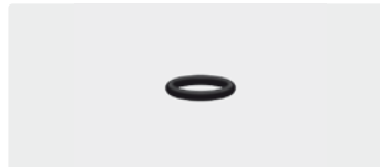
O-ring. 10x2. Perbunan