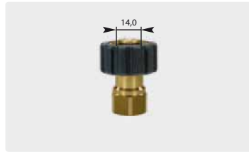
Standard M22 : F. Black. Max. 400 bar / 150 °C