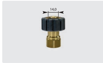
Standard M22 : F. Black. Max. 400 bar / 150 °C