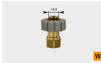
Standard M21: F. Grey. Max. 400 bar / 150 °C