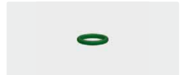
O-ring. 10x2. Viton