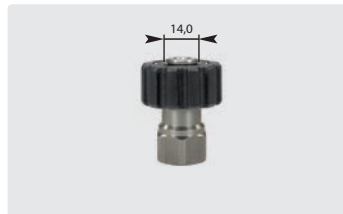
M22 : F. Stainless steel. Max. 500 bar