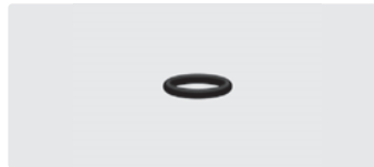
O-ring. 10x2. Perbunan