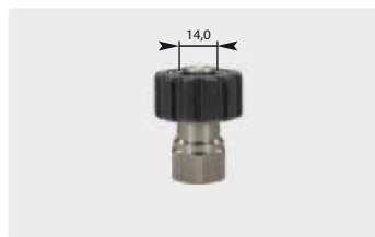
M22 : F. Stainless steel. Max. 500 bar