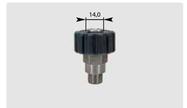
M22 : M. Stainless steel. Max. 500 bar