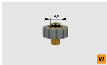
Short M21 : M. Grey. Max. 400 bar / 150 °C