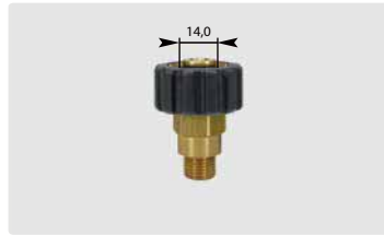
Standard M22 : M. Black. Max. 400 bar / 150 °C