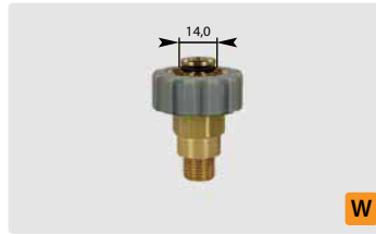
Standard M21 : M. Grey. Max. 400 bar / 150 °C