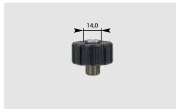
Short M22 : M. Stainless steel. Max. 400 bar / 150 °C