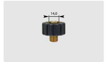
Short M22 : M. Black. Max. 400 bar / 150 °C