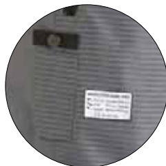
Knife pocket on right leg.