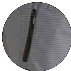
2 pockets with waterproof zippers.