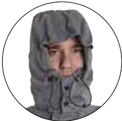
Detachable hood with 3 adjustment possibilities and room for hearing protection.