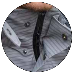
Waterproof zippers with overlapping flap.