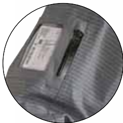
Pocket for ID card on the right sleeve.