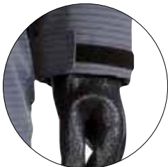
Comfortable inside arm cuffs prevent leakage.