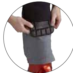
Pockets for knee pads.