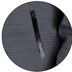
2 pockets with water-proof zippers.