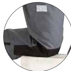
Reinforcements on the knees.