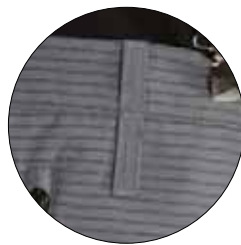
Double belt loops.