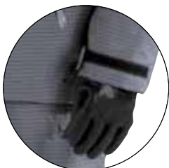
Cuffs adjustable with Velcro.