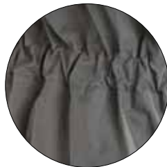
Adjustable elastical back waist.