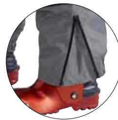
Zippers down on the legs.