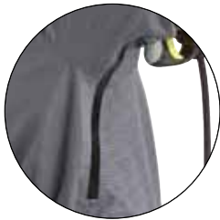
Openable ventilation in the armpits.