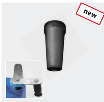
ST-83 adapter for 5 - 30 liter canisters. Incl. 0.5 m clear PVC hose for suction of chemicals, DN 4