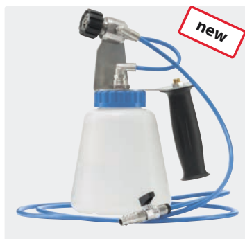
Disinfection cold fog air device ST-83. For compressed air connection 3 bar, 180-220 l / min. Stainless steel / plastic