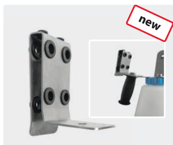
ST-83 window bracket with elastomer protection rings. Stainless steel