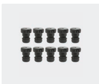
Exchangeable nozzle inserts. Plastic. 10 nozzle inserts (0.5 - 2.0 mm). Incl. o-rings