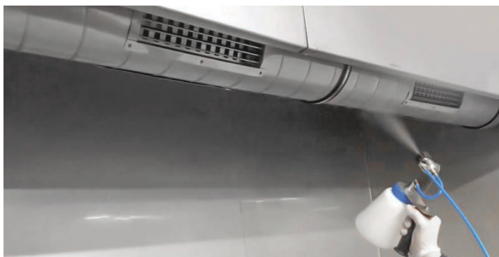
Ventilation systems: For the targeted disinfection of the air inlet you will find the nozzle for the larger throw range in the scope of delivery.

The ST-83 cold fog device is supplied with a 0.7 mm dosing insert.