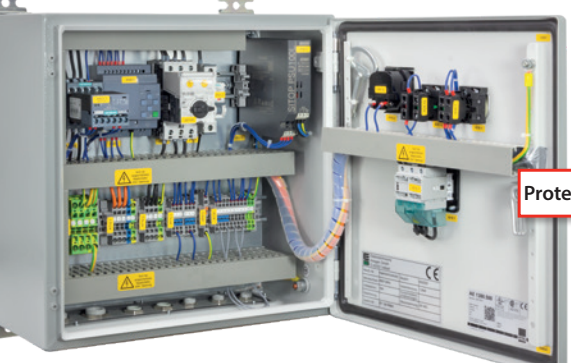
Mounting: The fastening straps on the back are also rotatable by 90 °.