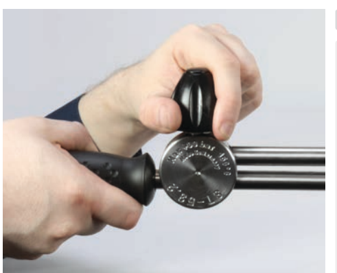
safe and simple handling: the ergonomic design of the side handle on top.