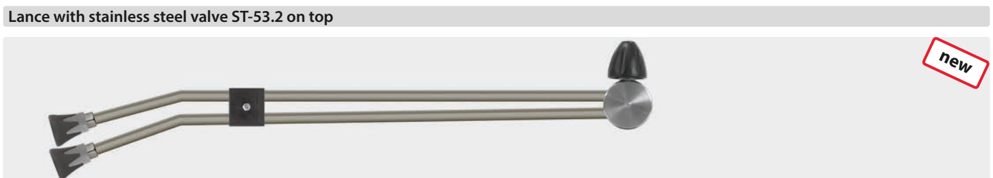
1/4" F. Lance with valve ST-53.2 on top and nozzle protector ST-10 with low pressure nozzle. Max. 400 bar / 150 ^{\circ}\text{C}